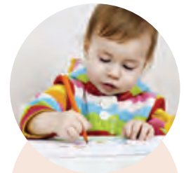
Illumiscreen prenatal test: whole-genome sequencing